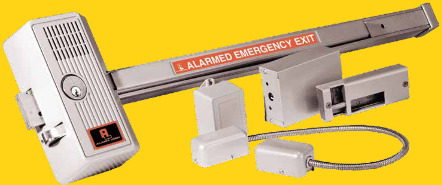
Sirenlock™ Model 715